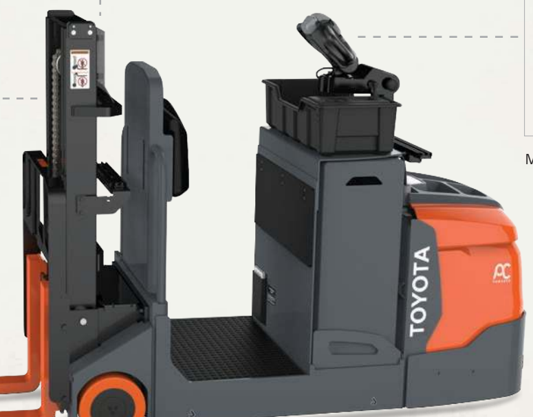
MOVES LOADS LIKE A PICKER